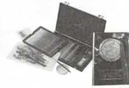
Gift (painting tool and shield) 20th Edition, 2019