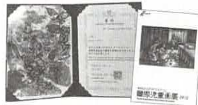
Certificate and Collection Book 20th Edition, 2019

Venue Cultural facilities in Kanagawa Prefecture