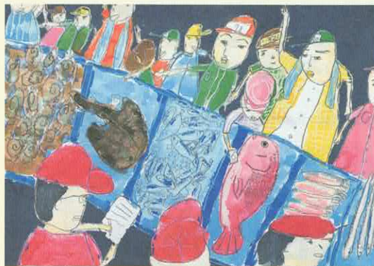
The 20th Grand Prize (2019)