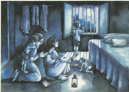
The 20th Grand Prize (2019)

Numerous pictures will be sent from all over the world. "Let's be friends, with children around the world through the art."