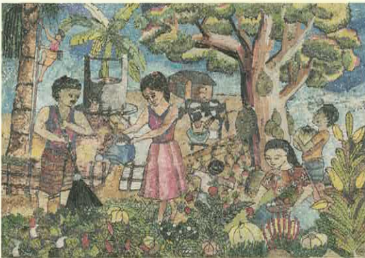
The 20th Grand Prize (2019)